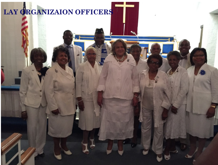
LAY ORGANIZAION OFFICERS