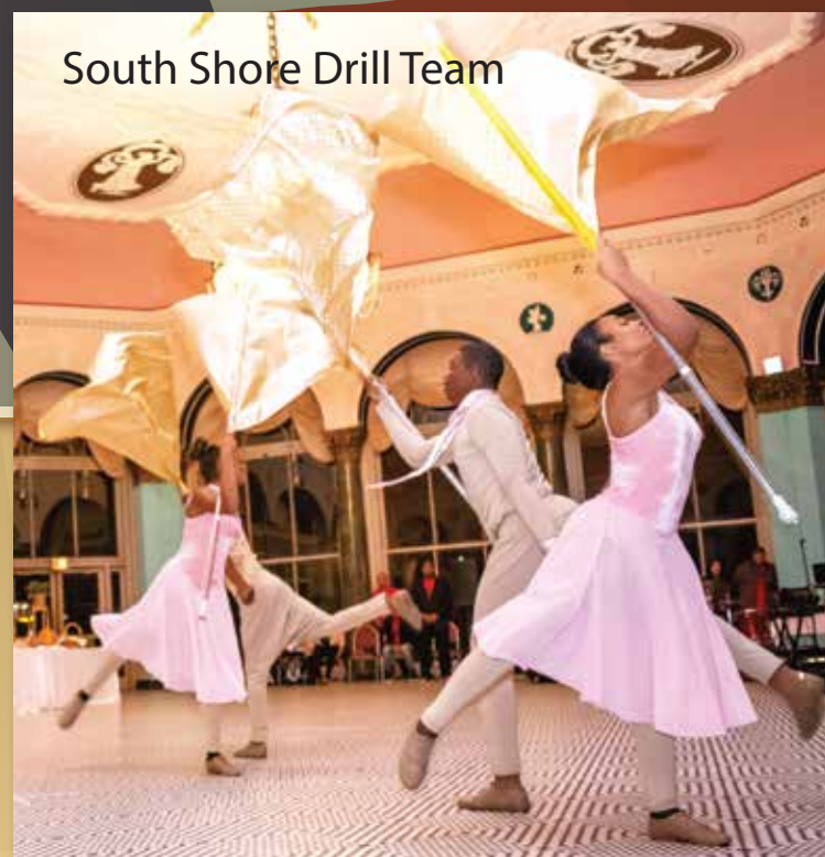
South Shore Drill Team